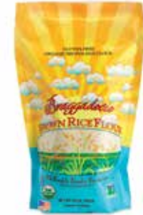
Organic Brown Rice Flour NET WT 20 OZ (567g)