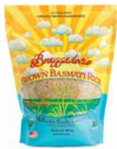
Organic Brown Basmati Rice NET WT 32 OZ (907.2g)