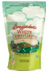
Organic White Corn Grits NET WT 20 OZ (567g)