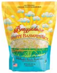
Organic White Basmati Rice NET WT 32 OZ (907.2g)