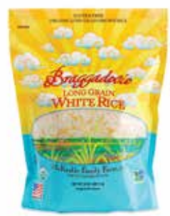
Organic Long Grain White Rice NET WT 32 OZ (907.2g)