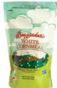
Organic White Cornmeal NET WT 20 OZ (567g)