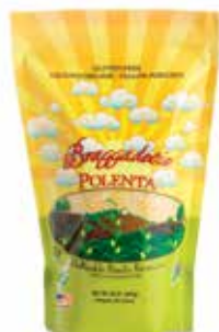
Organic Popcorn Polenta NET WT 20 OZ (567g)