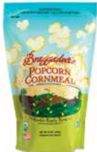
Organic Popcorn Cornmeal NET WT 20 OZ (567g)