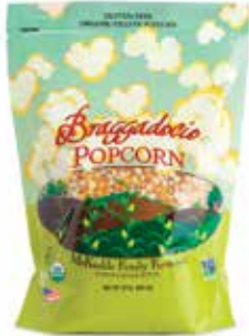
Organic Popcorn NET WT 32 OZ (907.2g)