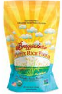
Organic White Rice Flour NET WT 20 OZ (567g)