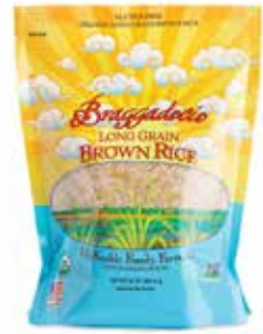
Organic Long Grain Brown Rice NET WT 32 OZ (907.2g)